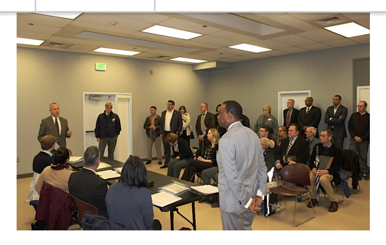
Mayor Darrell Steinberg addresses the TCC grant review panel on how the proposal will transform the River District and the downtown Sacramento area.